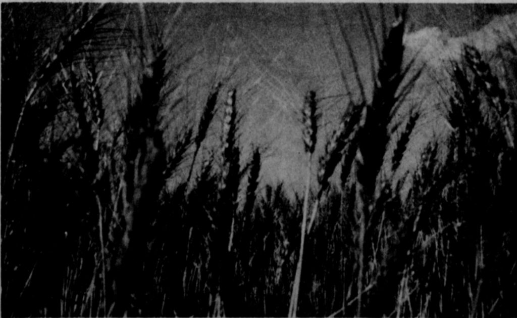
"Amber waves of grain" -- a thrilling sight anywhere but particularly in our Panhandle Area where our livelihoods hang on such a slim but sturdy stalk.