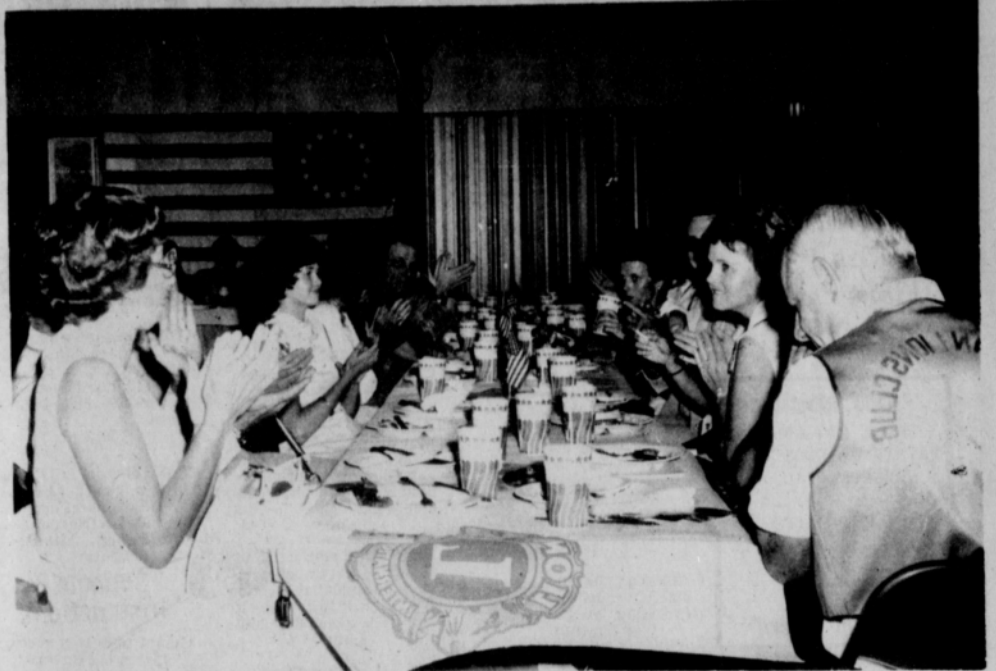
This is part of the crowd that attended the recent Lions Club banquet in Spearman.

A new event will highlight the Firecracker Open. You can put $1 in the pot, and draw for your partner,