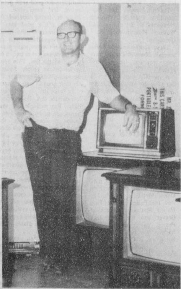
Congratulations to Everyone At EARLS TV in Spearman, on the occasion of your big 6TH ANNIVERSARY CELEBRATION!