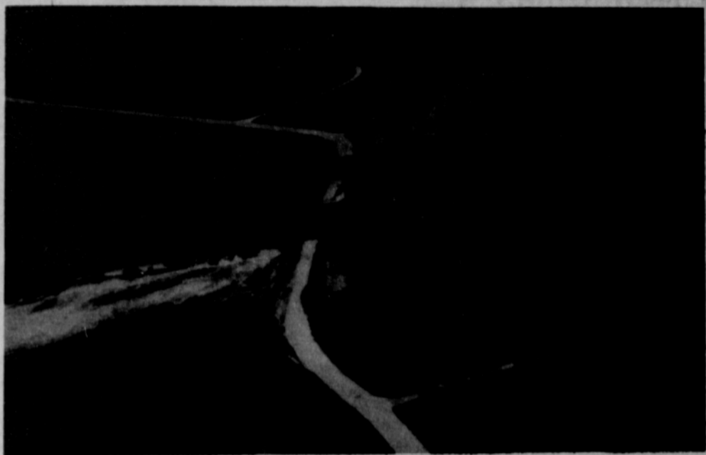
BRIDGE OUT-- Voters in Precinct Two will vote soon on a bond issue to build a bridge to replace the one which used to span Palo Duro Creek here. The force of the recent floods carried the concrete bridge away.

The Student Council has been working for more than two years to set approval for a student. This dance is just one of many fund raising activities carried on by the council to finance the program.