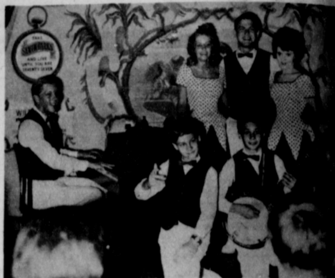
Six Flags Over Texas' staff of 1,500 talented youngsters, such as the group of Crazy Horse Saloon singers pictured here, create the fresh, entertaining and wholesome atmosphere that has made the $13,000,000 fun Park, located midway between Dallas and Fort Worth, the state's most popular tourist attraction.