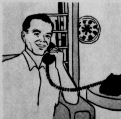
ANOTHER TELEPHONE IN THE DEN