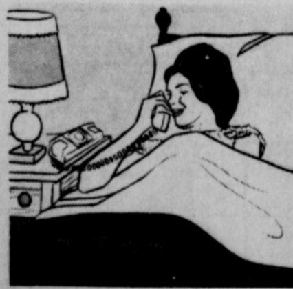
ANOTHER TELEPHONE IN THE BEDROOM

ADD-A-PHONE MONTH . . . get yours now for modern time-saving convenience