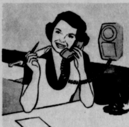
ANOTHER TELEPHONE IN THE KITCHEN