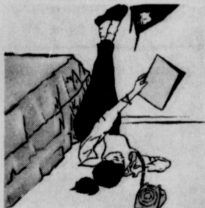
ANOTHER TELEPHONE FOR TEEN-AGERS