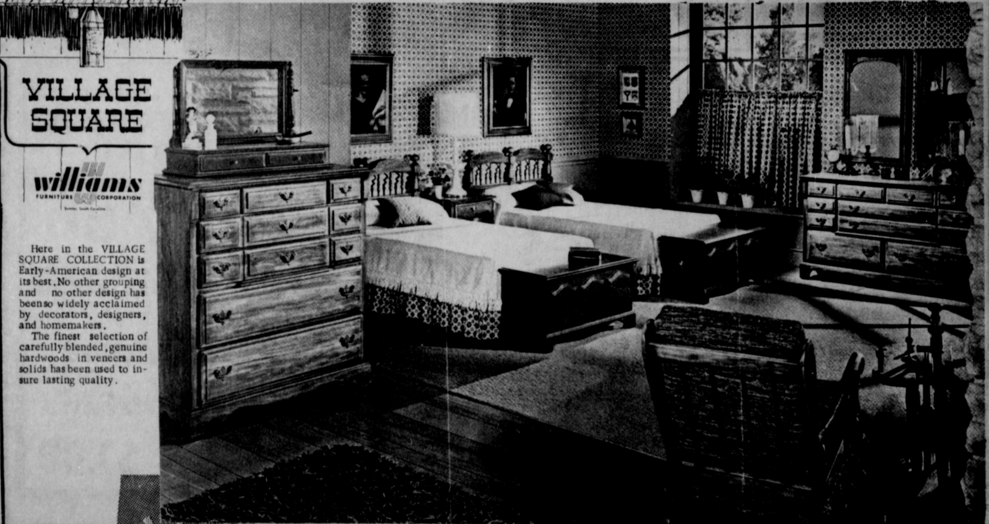
dining room, living room, bedroom & occasional furniture