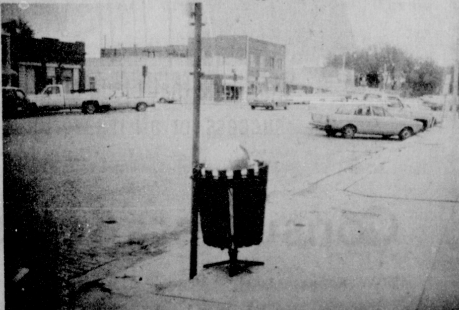
The City of Spearman installed several new litter containers on Main Street this past week. Hopefully this is the beginning of a cleanup of the city in preparation for Hansford Roundup Days, June 1 & 2. This year the Roundup will be celebrating Hansford County's 100th Birthday.