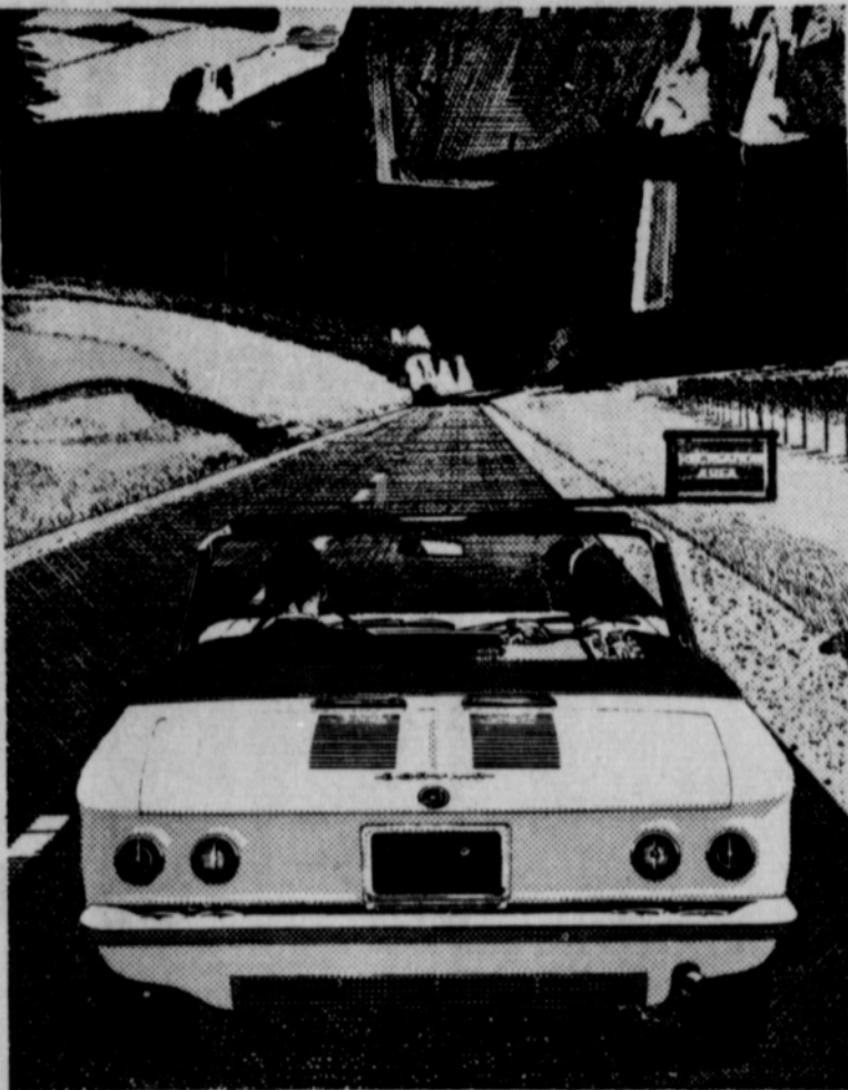
Monza Spyder Convertible