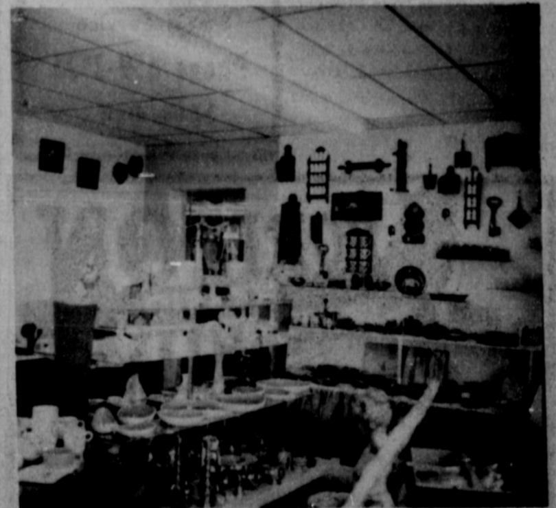
BEEDY'S GIFT GALLERY - now open in Plains Shopping Center offers customers a wide variety of gift selections. The store will specialize in gifts for brides and home accessories.