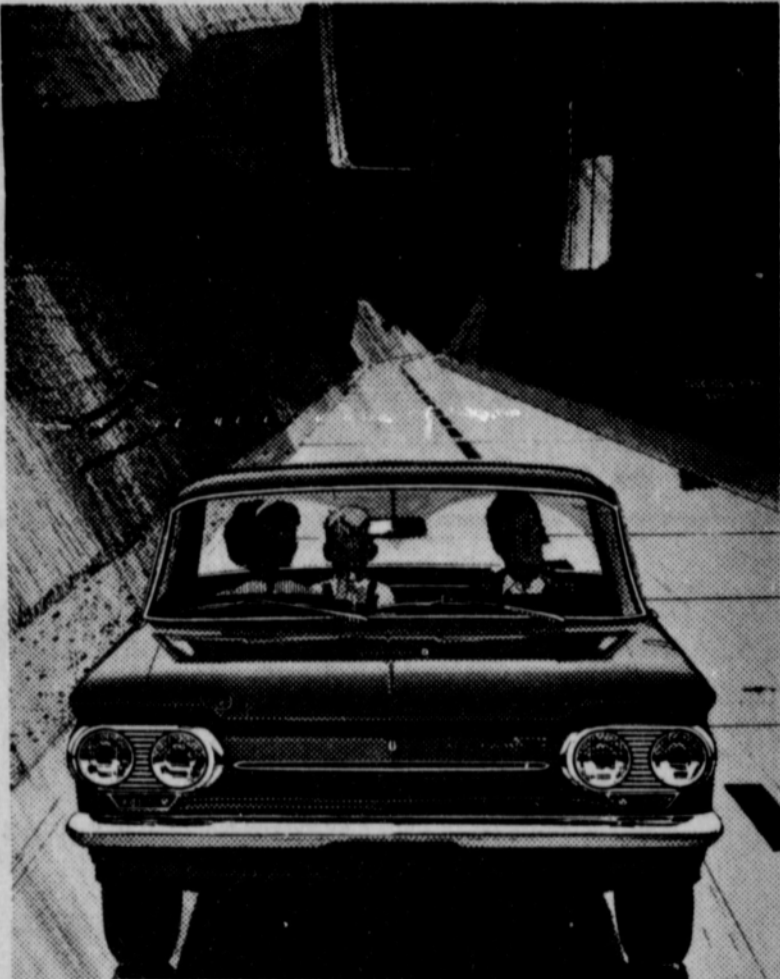
Monza Spyder Club Coupe