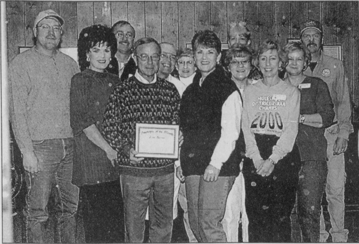
Journal photo: Beatrice Morin