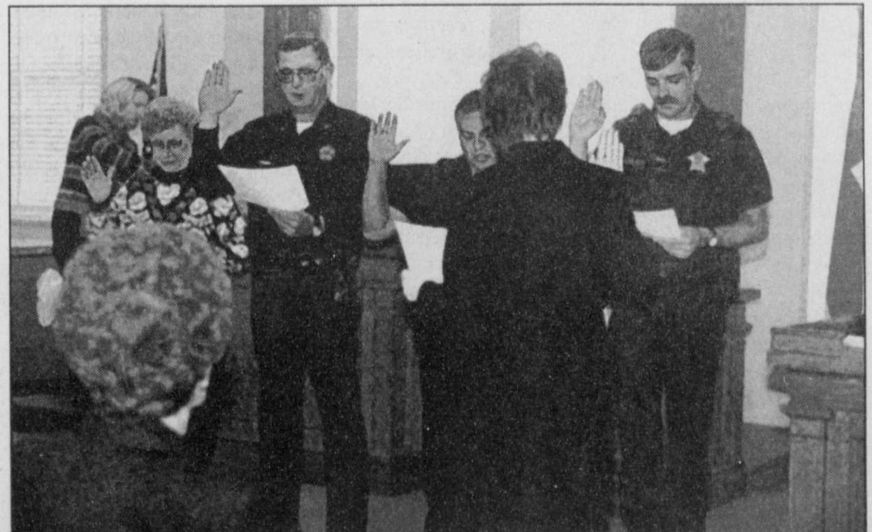
Journal photo: Beatrice Morin