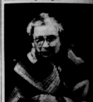
Special Care Unnecessary

It contains no moving parts — motor, fan, pump, belts, discs, float, etc. — to "lime up," corrode, or cause troublesome or costly service problems. The unit is available in both drain-type and recirculating designs.