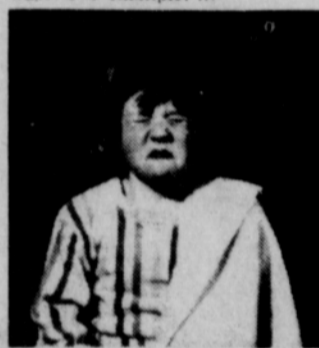
Children Are Vulnerable

Equipping a gas or oil-fired forced warm air furnace with a power humidifier proves an extremely low cost yet unusually profitable investment in diverse ways. For example, it: