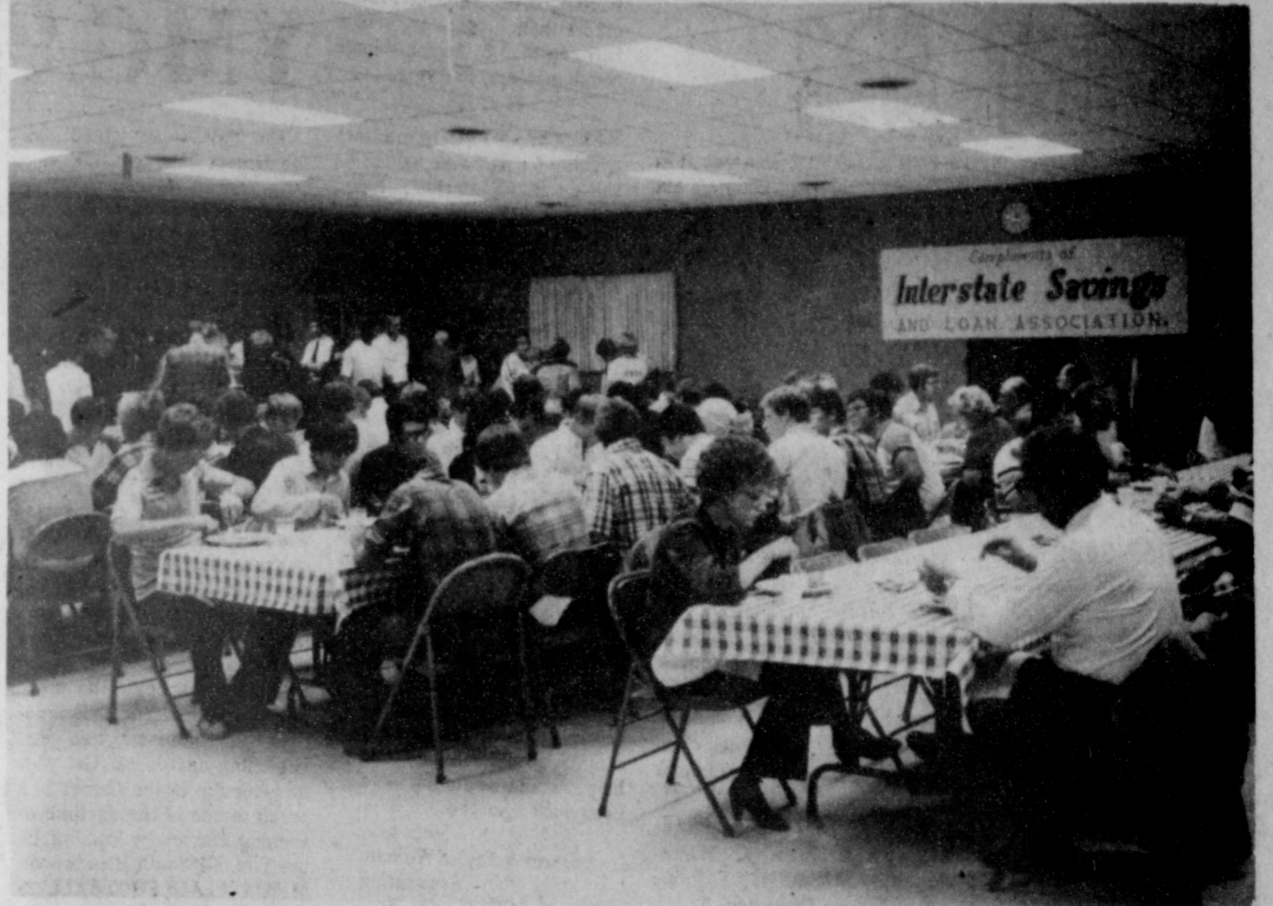
This is a picture of some of the local citizens who were on hand for the Chamber breakfast, sponsored by Interstate Savings here Thursday morning.