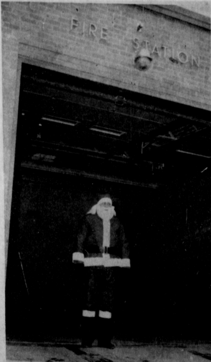
SANTA WAITS - Santa Claus had to wait here Saturday to make his entrance on Main Street. Santa always rides into town on a fire truck. Just as he was to arrive, the firemen had to answer a fire alarm.