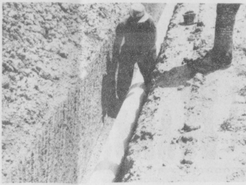
Underground irrigation pipeline, shown being installed above, can help reduce irrigation costs. The irrigation pipeline will reduce soil erosion, evaporation and seepage loss problems associated with open earth ditches. Water losses on a typical ditch run about one gallon per hour per foot of ditch or about 2.12 acre inches of water in a half mile ditchline per day. For further information on design and installation or irrigation pipelines contact the Soil Conservation Service in Spearman.