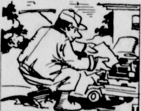
TESTING —Make sure to test your machine—attachments, safety devices, controls—before heading for the snow.

the committee staff in Washington. The audience attacked policies on agricultural export, support payments, foreign investment into farmland, energy and governmental regulation. Palmy guaranteed all comments made by participants, even though most were antigovernment, would be studied by the committee and the U.S. Chamber's board of directors, and would be fed into the decision-making process.