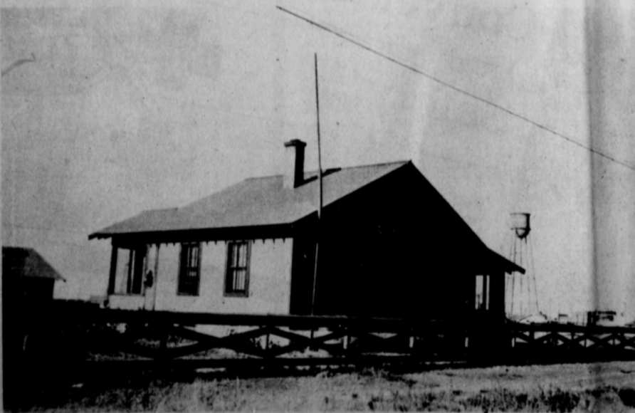
Agents cottage at Spearman Tex.

We don't want to get bigger We want to get better!