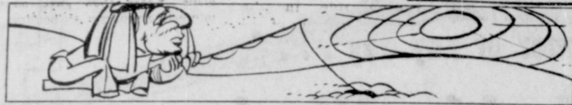
In some parts of the Sahara desert, there are underground streams. When people dig into the sand for water, they can sometimes catch live fish.