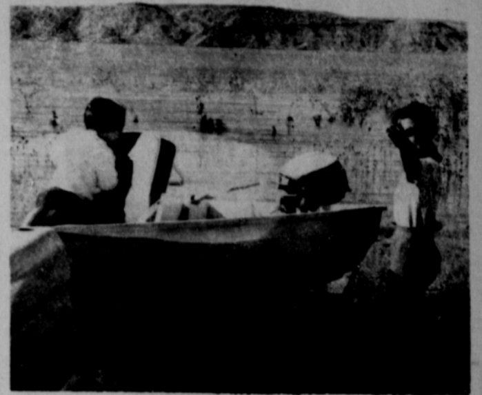
EASY DOES IT as the young lady guides her husband's backing into Lake Meredith at Harbor Bay. The boy seems to be enjoying it all.

Every teen ager is urged to attend and view the film.