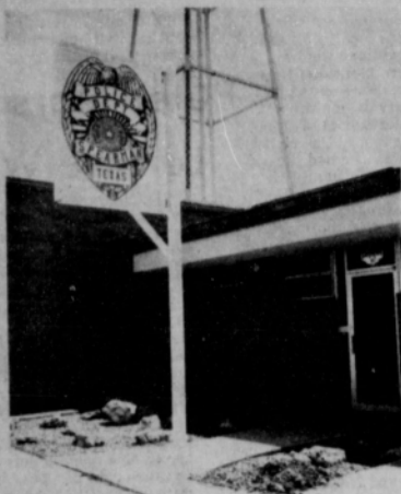
THIS SIGN HAS BEEN ERECTED at the City Police Department in Spearman, identifying the separate entry to the department from city hall offices.