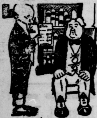
Pufferly—Doctor. I want to reduce. Physician—Your weight or my bill?—Chicago News.