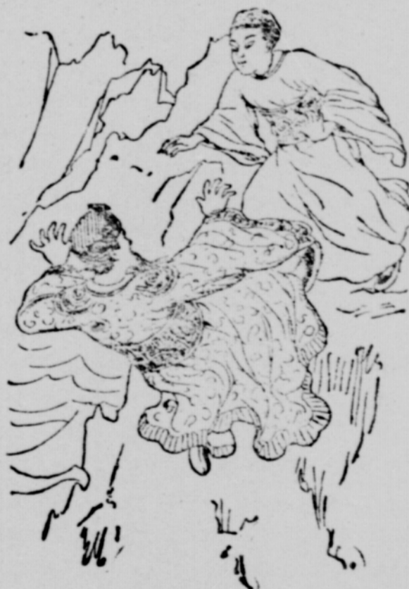
SHE PUSHED HIM FROM THE BRINK.

You can not afford to miss a single chapter. It is both entertaining and instructive, and will give you a keener insight into the character of a people about whom so little is known than can be obtained by reading volumes of history.