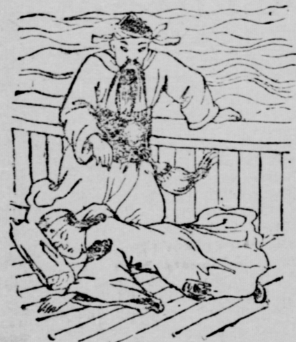
THE SHOCK THREW SHO MAI TO THE DECK.

murmured the captain. His words were drowned in a rush of waters as the descending mast plunged both into a deep black pool within the cave. Down, and ever down, sank Sho Mai, and in her ears the rumbling dwiniled to a soft, singing murmur, as if the eternal stillness of death were preluded by a strange, moaning music. She felt the arm that had held her loosen its hold, and give her a great impulse up-