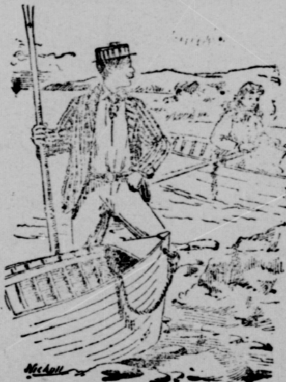
"MAY I MEET YOU HERE TO-MORROW?"

Never a better time than now to subscribe for your Home Paper. It gives you all the news, at home and abroad, besides the very best stories and miscellany.