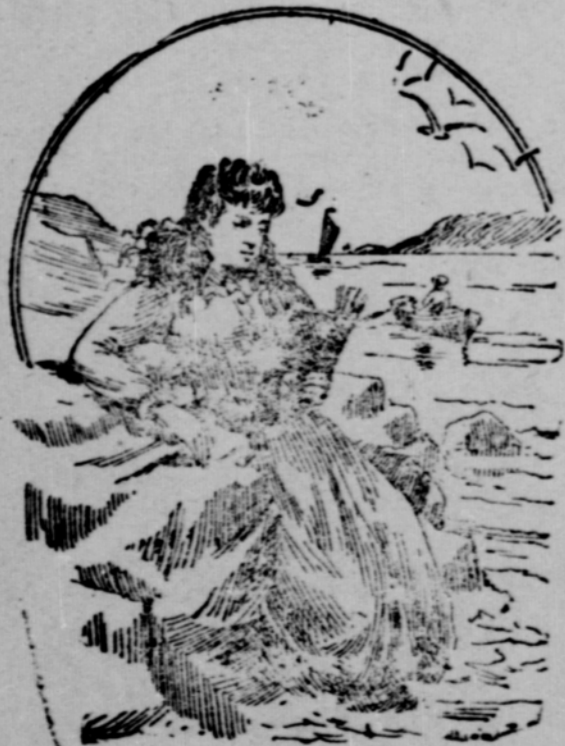
I READ ON AND ON.

Here is one of the most charming little stories that we have read in many a day; and it is with genuine pleasure that we announce its publication in this paper.