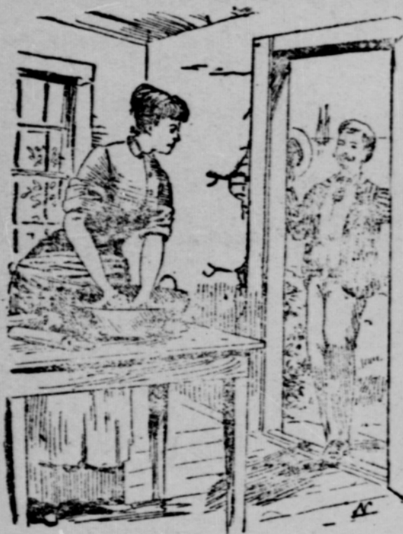
"CAN I GET SOME EGGS HERE?"

Here is one of the most charming little stories that we have read in many a day; and it is with genuine pleasure that we announce its publication in this paper.