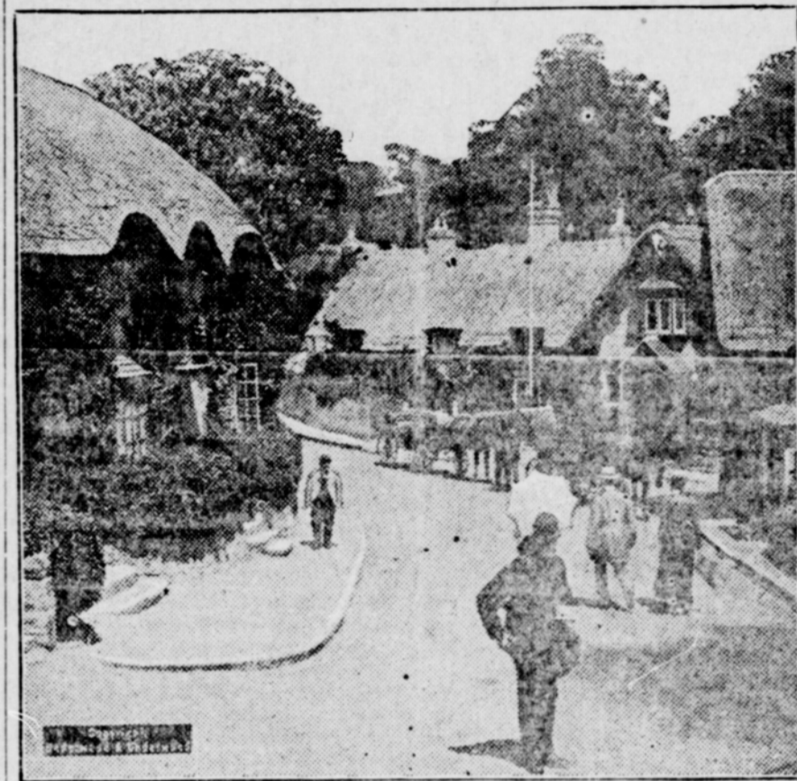
Village on Duke of Norfolk's Estate.

nerman, it is "more of a pleasure ground for the rich than a treasure house for the nation." Four hundred peers and peeresses, to use Mr. L. G. Chiozza Money's carefully prepared figures, own 5,730,000 acres; 1,300 great landowners own 4,320,000 acres; 2,600 squires own 4,780,000; 9,600 greater yeomen own 4,140,000; 220,000 lesser yeomen own 4,800,000; 700,500 cottagers own 150,000; while of the remaining 3,000,000 acres half is owned by public bodies and half lies waste. If the ownership be averaged, it will be found that a peer holds an average of 14,325 acres; a great land-