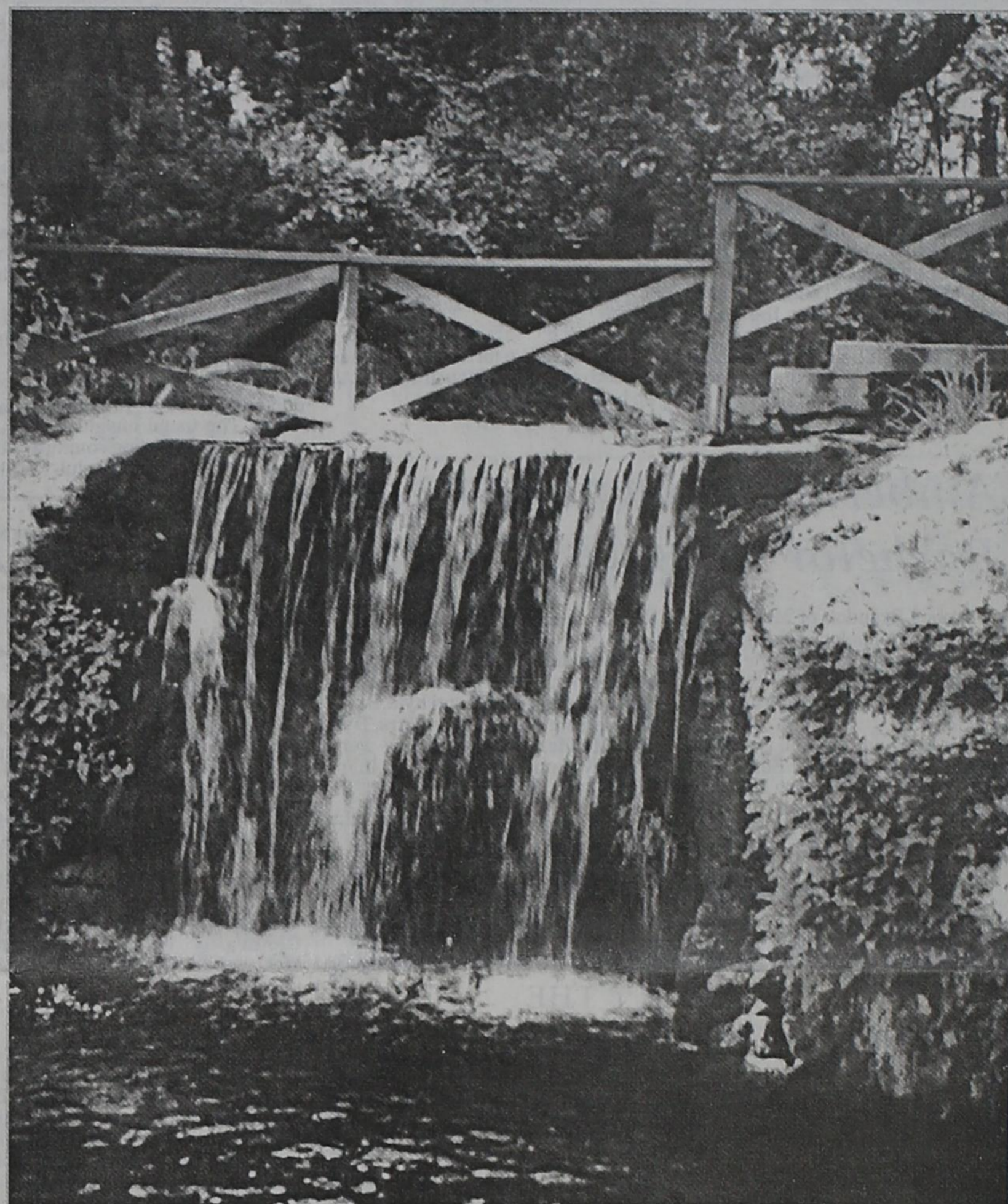
MOTLEY COUNTY BEAUTY - The waterfall at the Roaring Springs Ranch flows over the aged rocks and wild fern. The Roaring Springs waterfall is just one of the beautiful sights Motley County residents are fortunate to have.