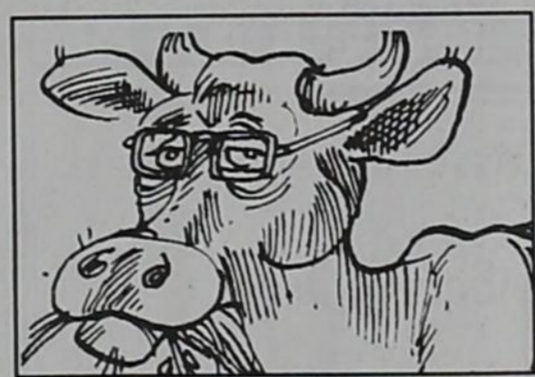
An Irish cow, Big Bertha, lived to the record age of 48 before her death in 1993. In addition, she gave birth to a record 39 calves.

Things are beautiful if you love them. —Jean Anouilh