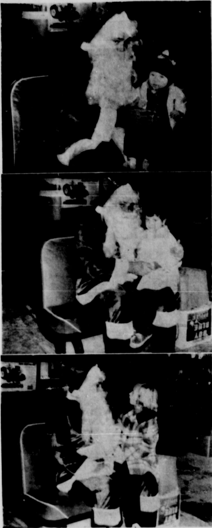
They Talked with Santa Claus . . .