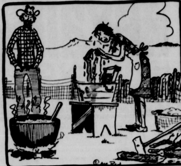
"If they ever have a 'Ranchwomens Hall of Fame' I bet I'm the first one nominated."

This feature sponsored by THE FIRST STATE BANK