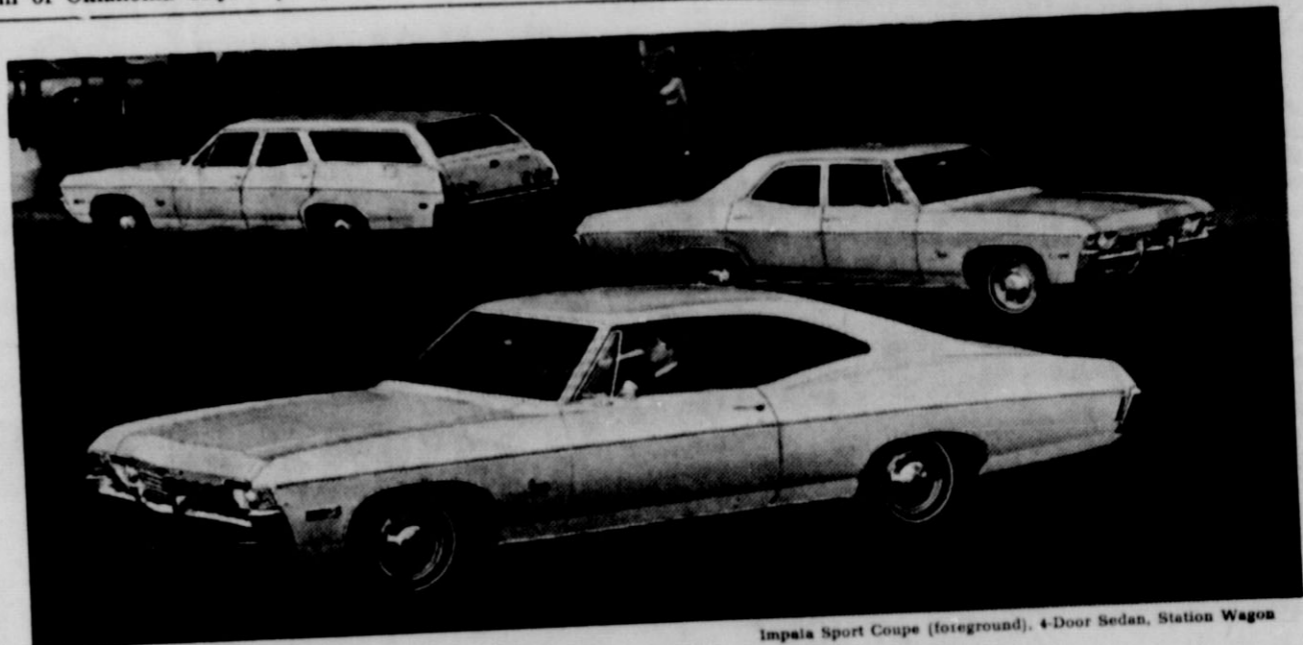
Impala Sport Coupe (foreground), 4-Door Sedan, Station Wagon