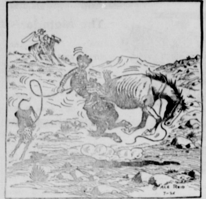
"Now, now, ol' hoss! Jist wait a minute, will you!"

This feature sponsored by THE FIRST STATE BANK