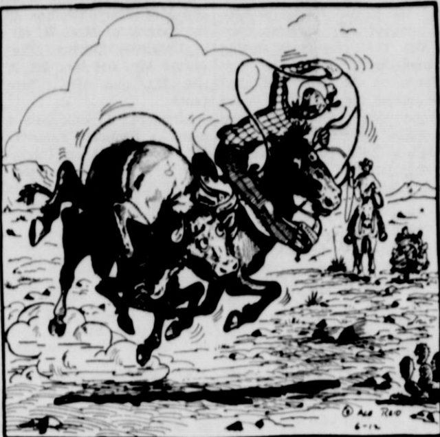
"When a stupid cowpoke ropes a crazy cow on an ignorant hoss, this outta happen to 'em."

This feature sponsored by THE FIRST STATE BANK