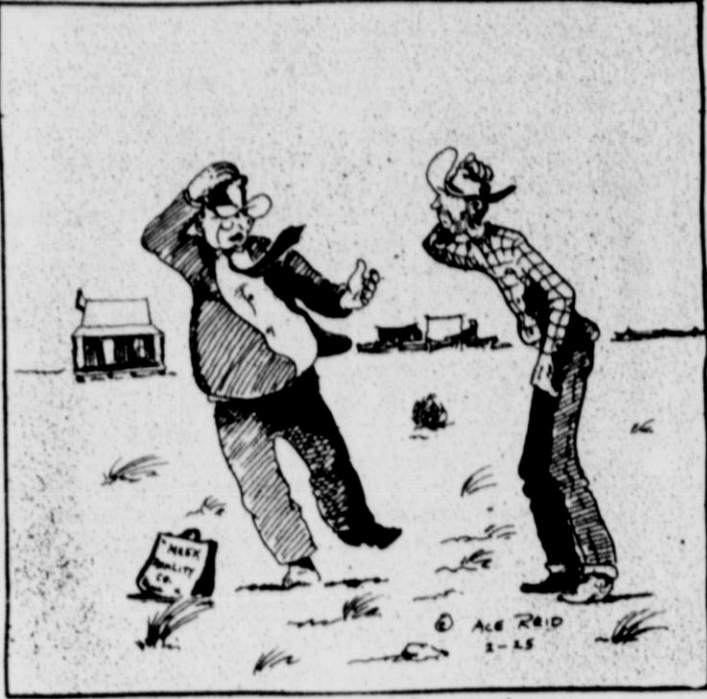
"On this farm you don't even hafta rotate the crops, the wind rotates the soil for you!"

THIS FEATURE SPONSORED BY FIRST STATE BANK