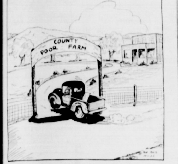
Oh, I just like to stop here and listen to them boys tell about when they wuz in the livestock business.

This feature sponsored by THE FIRST STATE BANK