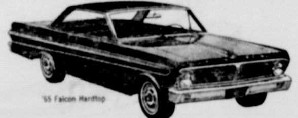
'65 Falcon Hardtop