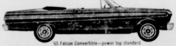
'65 Falcon Convertible—power top standard

Want a compact? Get our Falcon! Want a middle-size car? Get our Fairlane! Both packed with savings. Both in stock for immediate delivery. V-8's or Sixes!