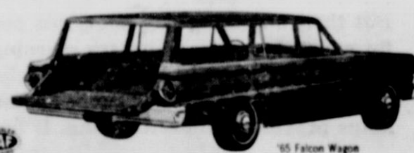
'65 Falcon Wagon