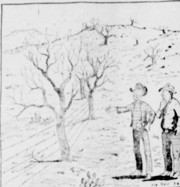
No, it ain't exactly where you said put it, but just look. We didn't have to dig one post hole!

This feature sponsored by THE FIRST STATE BANK