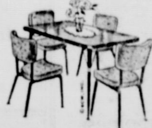
5-PIECE DINETTE GROUP

NEW TELEVISION SETS Radios - Clocks - LAMPS