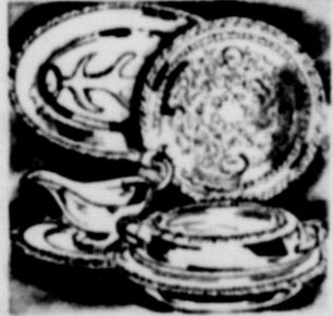
GLASSWARE DINNERWARE SILVERWARE