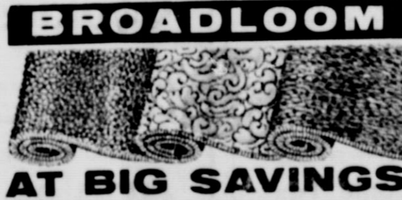
BROADLOOM AT BIG SAVINGS