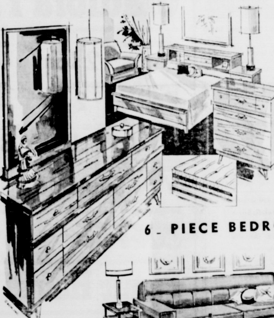
6-PIECE BEDROOM We Guarantee Your Satisfaction

We want you to see this furniture and we want you to price it and compare our values with fine furniture anywhere.