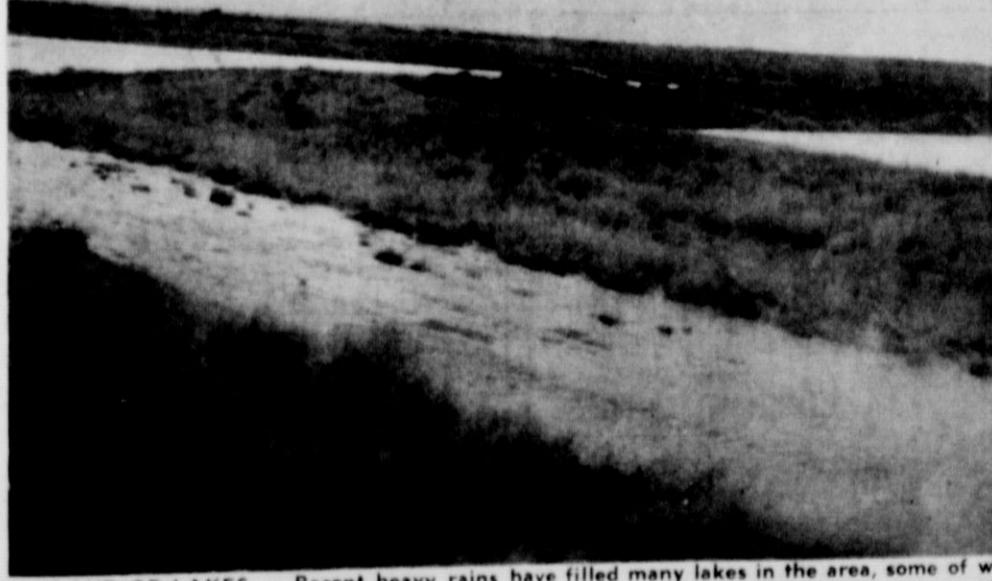
LAND OF LAKES — Recent heavy rains have filled many lakes in the area, some of which had been built two years or more without catching runoff. The above picture was made at Jameson Lake about 1½ miles east of Matador, just north of US Highway 70. Two dams were constructed across Ballard Creek and photo shows water flowing from the upper lake into the lower basin. Last week the lower dam needed only about 12 inches more of water to run over the spillway. At present plans by Jameson Brothers are to use the water for irrigation purposes.