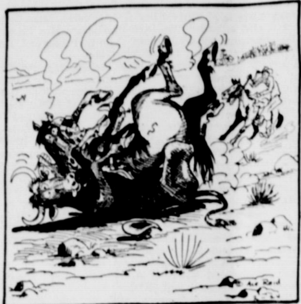
"I'll say you turned her, Jake . . . right under your hoss!"

This feature sponsored by THE FIRST STATE BANK