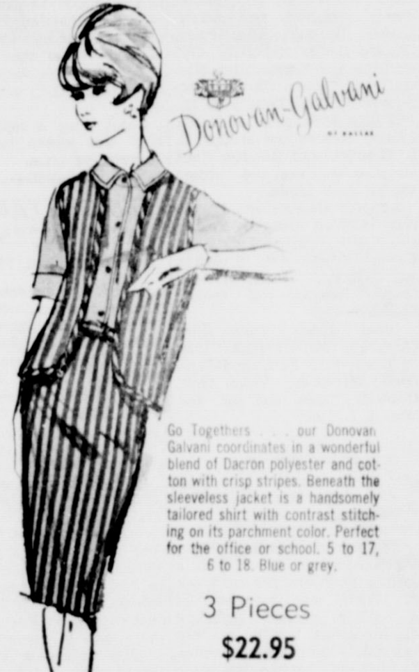
Go Together... our Donovan Galvani coordinates in a wonderful blend of Dacron polyester and cotton with crisp stripes. Beneath the sleeveless jacket is a handsomely tailored shirt with contrast stitching on its parchment color. Perfect for the office or school. 5 to 17, 6 to 18. Blue or grey.