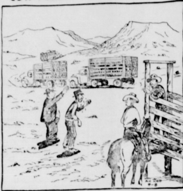
"Well, sir, the one a cryin' was the owner and the one a smilin' is the banker."

This feature sponsored by THE FIRST STATE BANK