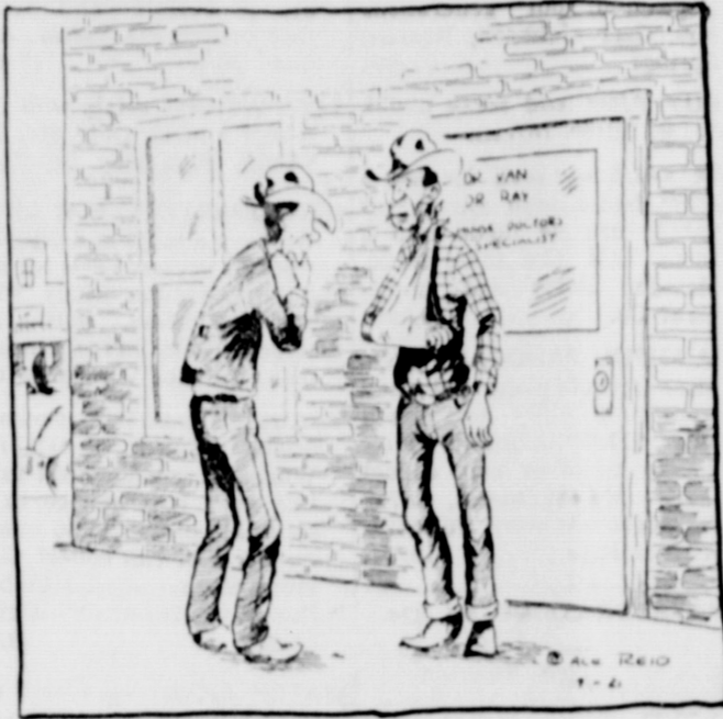
"The banker broke it. He was a little anxious for that cattle check I just got."

This feature sponsored by THE FIRST STATE BANK