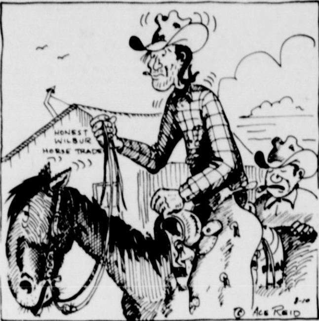
"Jake now that hoss has an easy gait, you've just got a rough saddle!"

THIS FEATURE SPONSORED BY FIRST STATE BANK