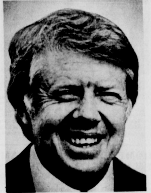
James E. Carter

CONTINUING ITS LONGTIME PATTERN OF VOTING DEMOCRATIC, MOTLEY COUNTY TUESDAY BACKED THE CARTER-MONDALE TICKET, ALTHOUGH BY A SMALL MARGIN OF 522 TO 428 FOR PRESIDENT GERALD FORD AND VICE-PRESIDENT DOLE, JOINING THE NATION IN THE ELECTION OF JAMES EARL (JIMMY) CARTER OF PLAINS, GEORGIA AS PRESIDENT OF THE UNITED STATES.