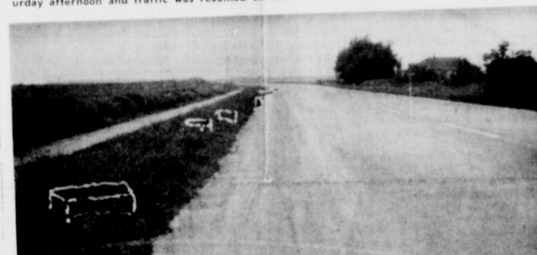
HAY IS WHERE YOU FIND IT — Bales of hay were washed out of Bill Jones' field onto US Highway 70. Above photo, looking west toward Matador, was made during rain. Bales of hay have been outlined to show. A large tumbleweed was on the highway near the bale in the foreground, when a Highway Dept. employee tossed it out of the road. A rattlesnake seeking refuge in the weed, fell out into the high grass and escaped.