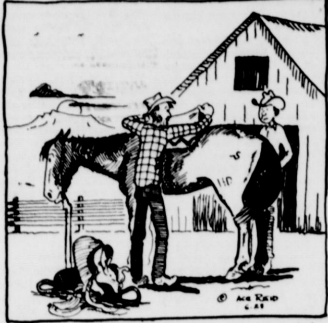
"The boss on this place lets the boys sleep 'til daylight, otherwise, they'll be sleepin' all day under mesquite bushes and then we won't get anything done!"

THIS FEATURE SPONSORED BY FIRST STATE BANK