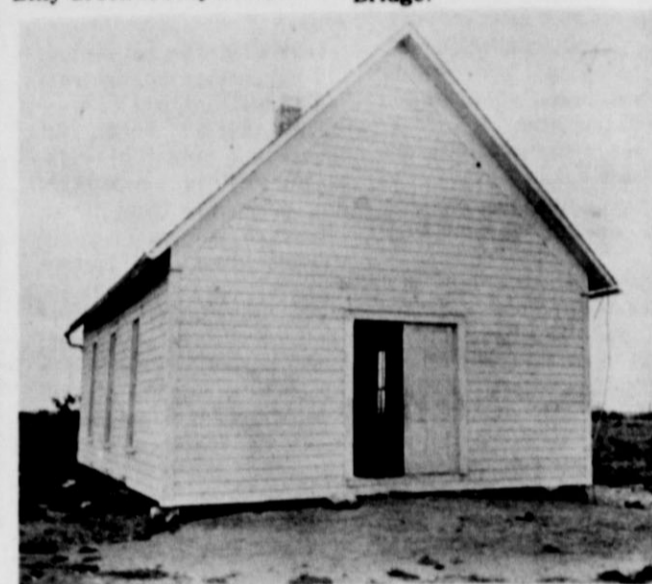
PIONEER SCHOOLHOUSE -- The old Ballard School,