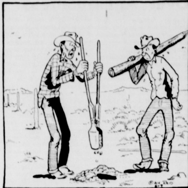
"You know Zeb, we're lucky... most people have to start from the bottom and work to the top!"

THIS FEATURE SPONSORED BY FIRST STATE BANK