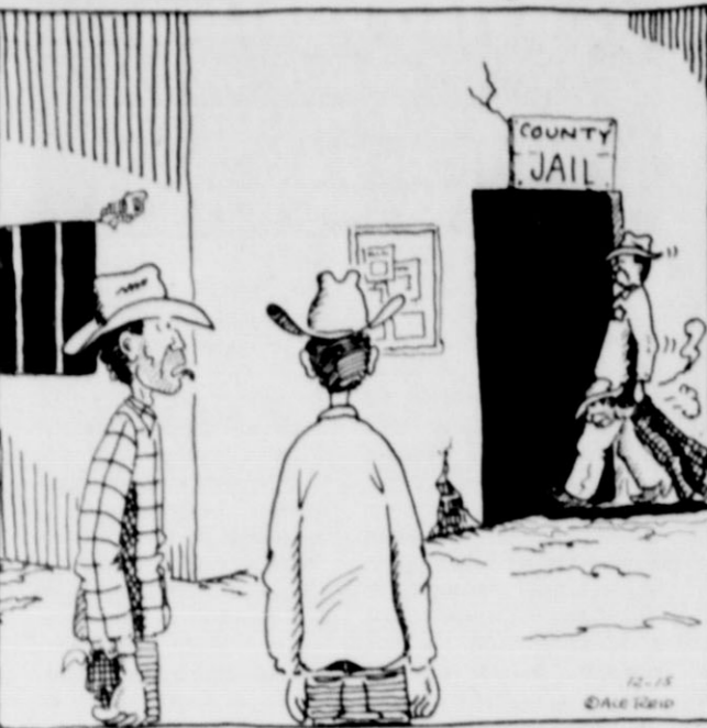
"Puttin' him in jail fer stealin' cattle—they oughta put him in the asylum!"

THIS FEATURE SPONSORED BY FIRST STATE BANK