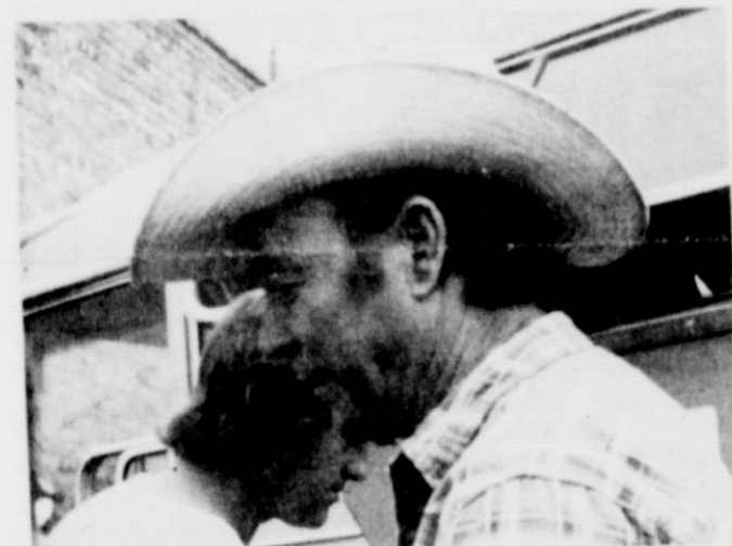
AUTOGRAPHS began early and continued late.