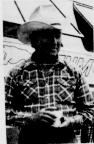
A CUP OF COFFEE before filming begins.