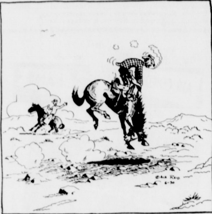
Just don't lose that light off that cigarette 'cause we've done used our last match!!

THIS FEATURE SPONSORED BY FIRST STATE BANK