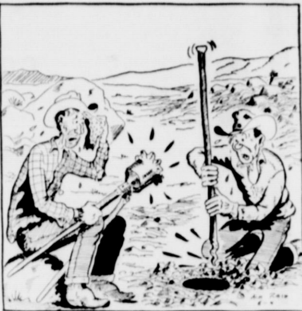
Sometimes I feel that when my ole paw left me this outfit, he just sentenced me to a lifetime of hard labor.

This feature sponsored by THE FIRST STATE BANK