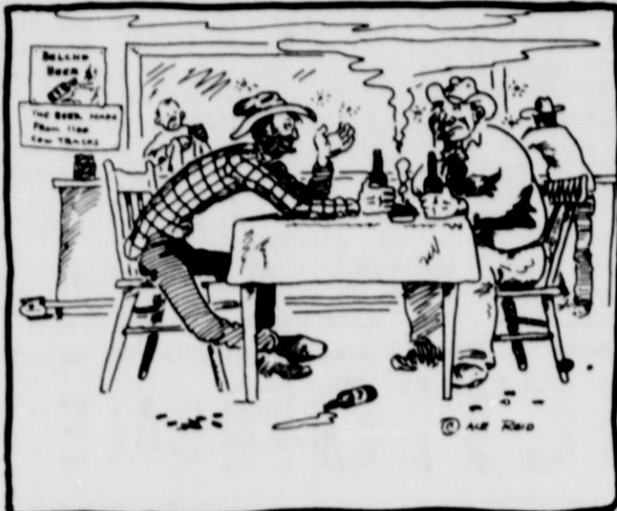
"Ain't it sumpin—when I came in here I was loaded down with problems. Now after 4 hours of beer drinking, I'm just loaded!"

This feature sponsored by THE FIRST STATE BANK