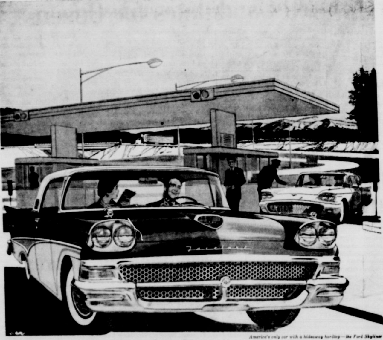
America's only car with a hideaway holding—the Ford Skyline shown here with the fabulous new 4-passenger Thunderbird

Matador & Tribune ISSUED THURSDAYS AT TRIBUNE BUILDING, 1001 MAIN STREET, MATADOR, TEXAS BY THE TRIBUNE PUBLISHING COMPANY OWNED BY MOTLEY COUNTY NEWS BY PURCHASE MARCH 14, 1958, AND WITH THE READING SPRINGS REPORTER BY PURCHASE APRIL 28, 1958. THE TRIBUNE IS SUCCESSOR TO THE ORIGINAL MOTLEY COUNTY NEWS ESTABLISHED IN MATADOR IN 1892 AND ALL OTHER SUBSEQUENT COUNTY PUBLICATIONS.