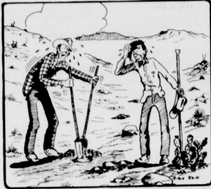
"I hope the boss realizes he's about to discourage this cowboy's great future in ranchin'."

This feature sponsored by THE FIRST STATE BANK