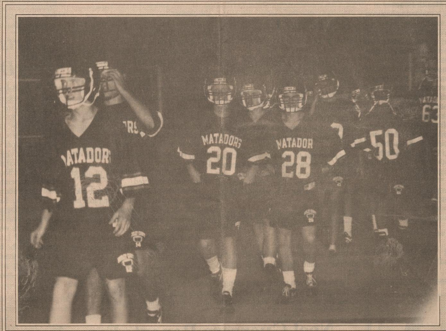
MIDNIGHT MADNESS — The Motley County Matadors were fired up and ready to get the season underway when they kicked-off two-a-day workouts at Midnight Madness, 12:01 a.m. Wednesday August 3. The Matadors will have their first scrimmage against Crosbyton, August 19.