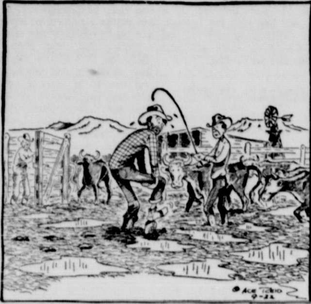
"The thing about these droughts—it gives a feller time to forget jist how muddy a dang cow lot gets."

This feature sponsored by THE FIRST STATE BANK