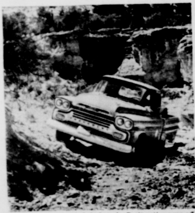
Up a steep mud-choked wash—Positraction pays off!