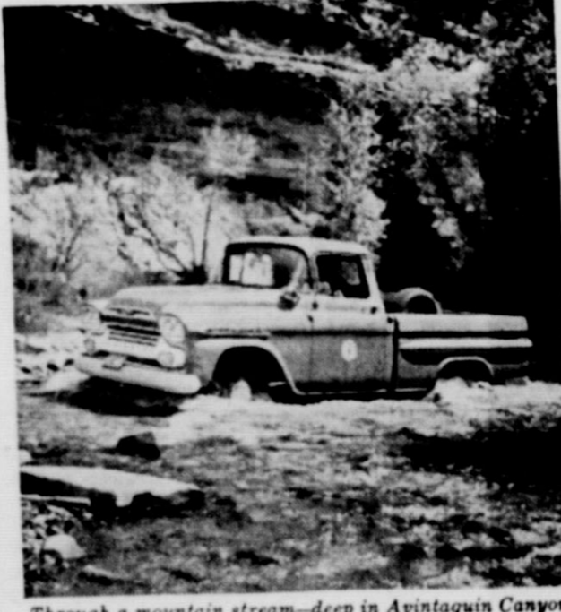
Through a mountain stream—deep in Avintaquin Canyon.