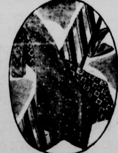
Summer Wash Ties