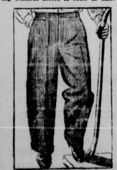
$1.75 Value Now $ 1.49

These well tailored pants are dressy and comfortable and will withstand wash-